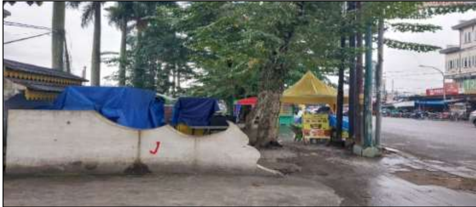
Figure 1. Entrance gate

key factor in efforts to improve the presentation of information, interactive technology and educational approaches can increase visitors' attractiveness and understanding of the cultural heritage on display. The following is the current condition of state museums which is very worrying: