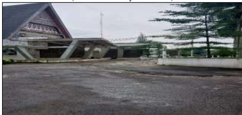
Figure 2.2. Road conditions inside the state museum