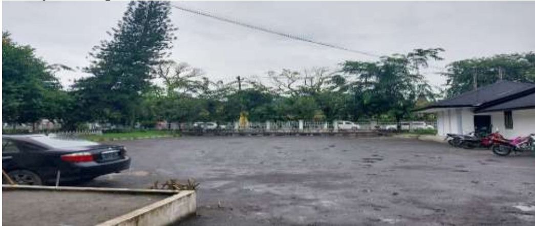
Figure 3.1. parking area 2

In figure 2.1. It was explained that the condition of the guard post at the entrance gate was unkempt, not cleaned and very messy. In figure 2.1. explained the current condition of the road in front of the building which is also quite damaged.