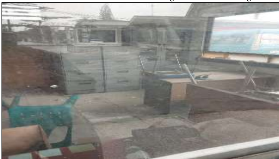
Figure 2.1. Entrance gate post

It is explained in Figure 1 that the condition of the entrance gate is quite worrying, it is covered by snack outlets and there is a lack of maintenance both for the gate and the entrance gate.