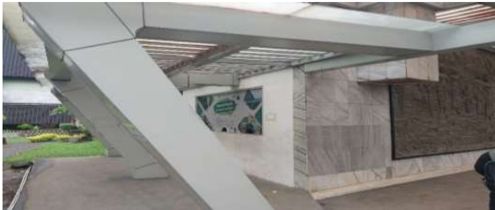
Figure 4.1. Counter place

In figure 3.1. and 3.2. explained the condition of the parking area in the area next to the post at the entrance gate and next to the post at the exit gate, the Medan State Museum has parking that is not effective enough because in parking area 2 there are no parking signs and parking area 1 is supposed to be for motorbikes.