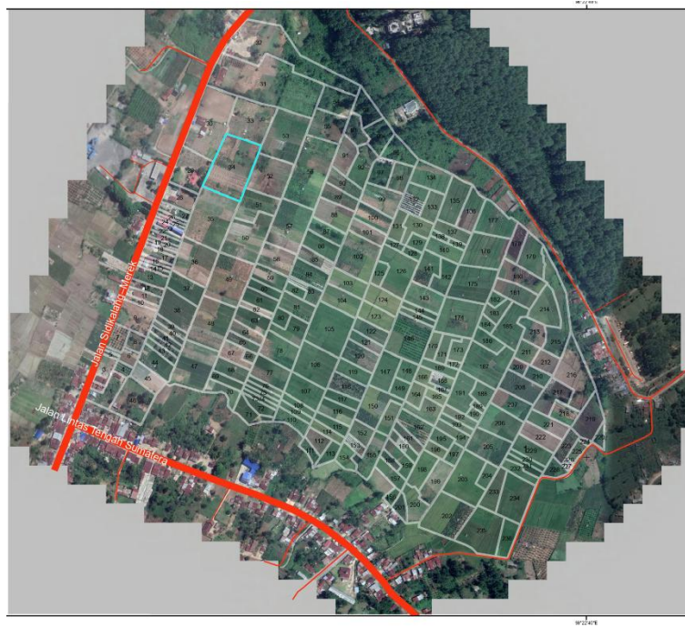
Figure 2. Map of Sitinjo 1 Village Before Land Consolidation